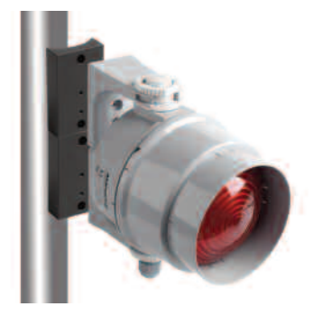
The new adaptor (accessory) allows quick and simple mounting on a tube (Ø 75 mm)