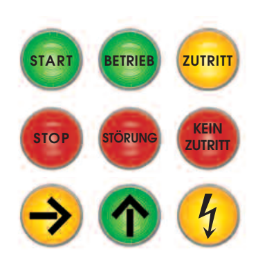
890 with adhesive sticker (accessory)