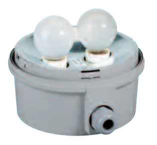
Permanent beacon with two sockets

Further colours and voltages on request.