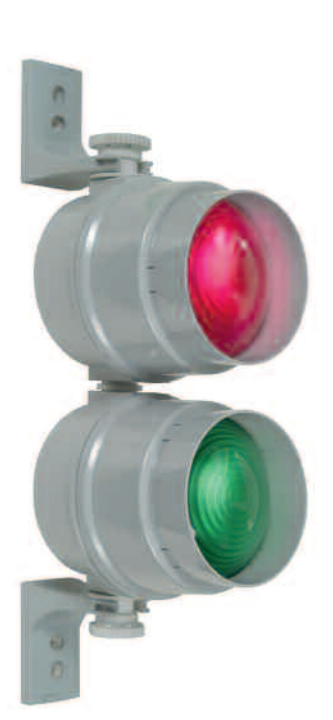
Traffic Light Combination with mounting bracket (accessory)